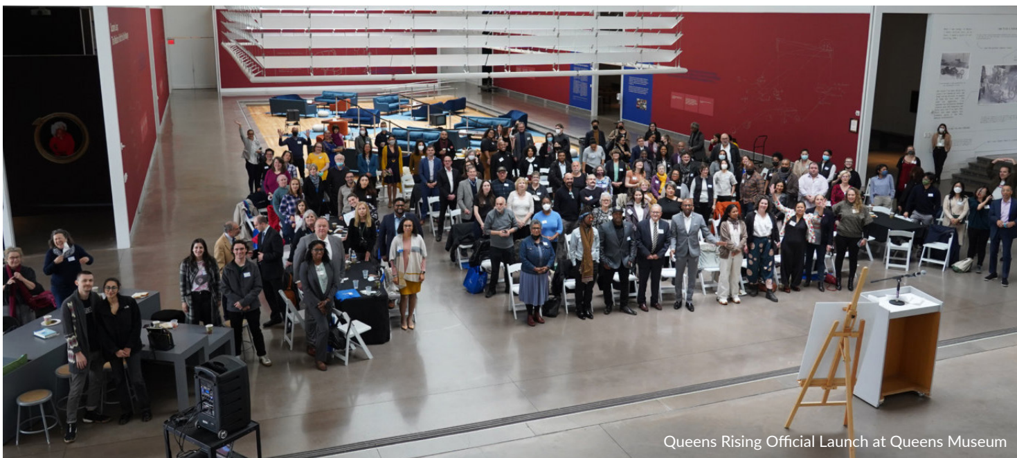
Queens Rising Official Launch at Queens Museum