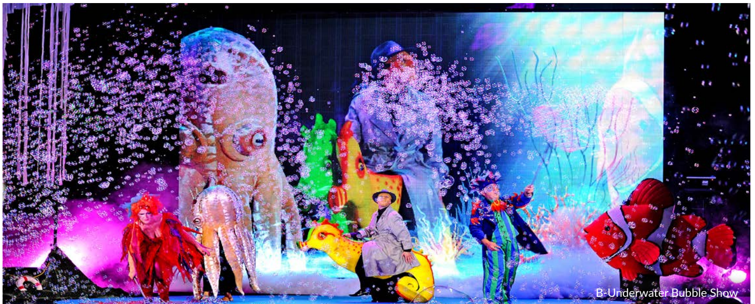
B-Underwater Bubble Show