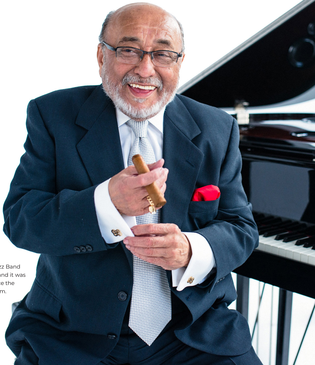
Photo: Eddie Palmieri Latin Jazz Band performed in November 2021 and it was the first in-person concert since the pandemic at Colden Auditorium.